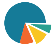
Share of California Alternative Powertrain Market - 2017